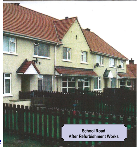
School Road After Refurbishment Works