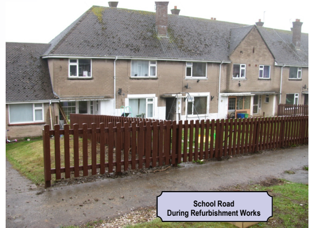
School Road During Refurbishment Works