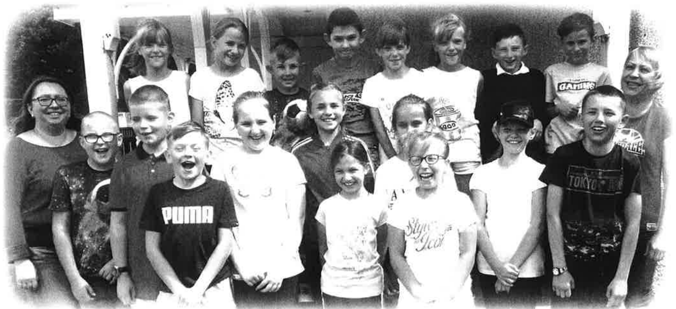
The IOM group in 2019